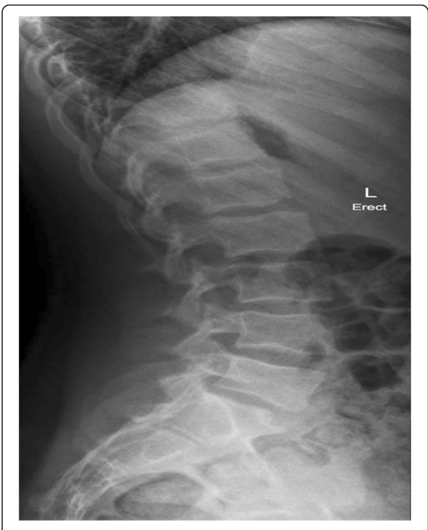
Figure 3 Lateral lumbar X-ray view. Note the suspicious area of increased sclerosis in the anterior half of the sacral base.

The patient was subsequently referred for MRI examination of the lumbar spine by the chiropractor to a private facility on the second visit to assess for lower