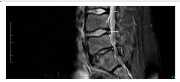
Figure 5 MRI, sagittal STIR midline image. Annular tears are seen as posterior annulus fibrosus hyperintensity (bottom two arrows pointing to white dots) at L4/5 and L5/S1 discs. Compare with low signal (dark) of the normal L3/4 disc (top arrow).

findings, as well as a recommendation to the mother that her son attends the additional opinion of a paediatric spine specialist for co-management. The short and long term prognosis of this patient's low back condition was of utmost importance, particularly as the patient was already in initial stages of puberty and therefore his growth will be highly accelerated in the following years. His antalgia and chronic low back pain were significantly affecting his quality of life, and his chronic use of