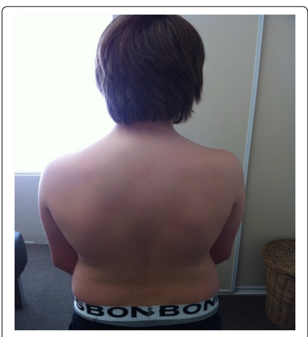
Figure 1 Posterior view of patient in neutral lumbar ROM. The posterior view shows a non-distressed young male with no visible scoliosis or antalgia.

Bilateral lower limb neurological examination was unremarkable, revealing 2+ patellar and achilles reflexes, intact sensation to light touch of L1 to S2 dermatomes, and 5/5 motor testing of L4 to S1 myotomes. Supine examination revealed a Straight Leg Raise (SLR) test that was negative for lower limb radicular pain production, and limited to 45 degrees bilaterally due to significant