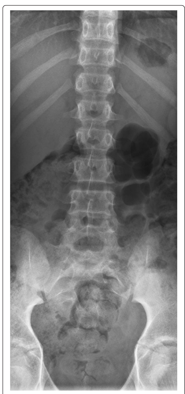
Figure 4 Antero-posterior X-ray lumbar view. Note the absence of scoliosis.

findings, as well as a recommendation to the mother that her son attends the additional opinion of a paediatric spine specialist for co-management. The short and long term prognosis of this patient's low back condition was of utmost importance, particularly as the patient was already in initial stages of puberty and therefore his growth will be highly accelerated in the following years. His antalgia and chronic low back pain were significantly affecting his quality of life, and his chronic use of