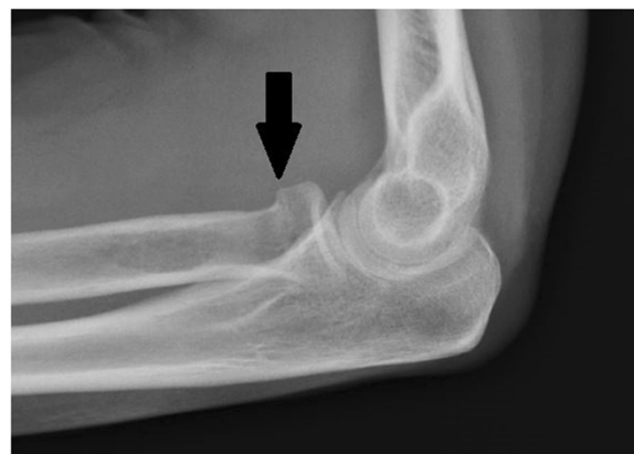
Figure 3 Lateral X-ray elbow view.

patient was referred to a general medical specialist for care. A clinical report and the radiologists report were forwarded to the referred physician. Verbal follow-up with the patient two-weeks later revealed that she had been referred to an orthopedic specialist by her primary care physician. The orthopedist elected not to cast the fracture due to small degree of displacement, lack of significant swelling, and range of motion within normal limits. She was restricted from performing any weight bearing exercise and was instructed to return in one month for follow-up X-ray to assess the healing of the fracture site. At four-weeks following the initial evaluation, a repeated radiographic examination demonstrated healing of the fracture site. At three month telephone follow-up the patient reported full use of her elbow with no pain in any ranges of motion.