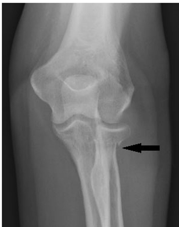
Figure 2 Antero-posterior X-ray elbow view. Note the approximately 2mm displacement of the radial head. Mason Type II Fracture.

Three days post initial consultation, the patient's X-ray results were received from the imaging center and the